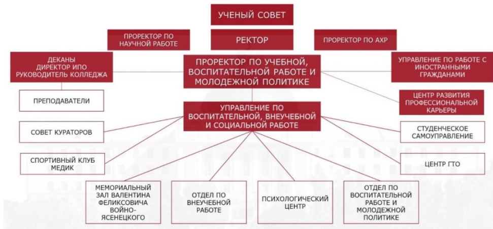
Fig. 1 - Structure of educational work and youth policy in KrasSMU.

12.4 Work on the organization of sports education of students and the organization of sporting events in extracurricular time is carried out by collaboration of structural divisions of the University: Sports Club "Medik" and department of physical culture.