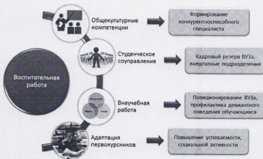
Fig. 1 - Structure of educational work and youth policy in KrasSMU.

12.4 Work on the organization of sports education of students and the organization of sporting events in extracurricular time is carried out by collaboration of structural divisions of the University: Sports Club "Medik" and department of physical culture.